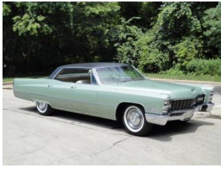
Klaus Deisinger's, 67 Sedan DeVille- 2nd place, primary #9!