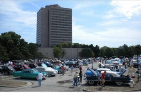
The Doubletree Hotel Overland Park-Corporate Woods, Overland Park, Kansa 2010 CLC Grand National Host Hotel